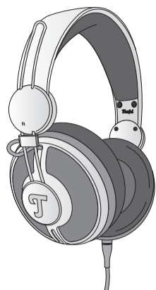
Aureol Real Headphones